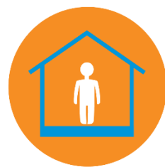
STAY HOME IF SICK