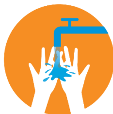
WASH OR SANITIZE HANDS THOROUGHLY AND OFTEN