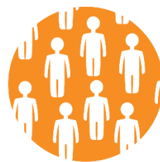
AVOID LARGE GROUPS/ GATHERINGS