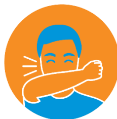
COVER YOUR COUGH OR SNEEZE