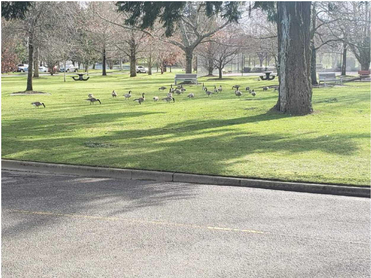
Photo 1: a gaggle of Canada Geese graze in Parksville Community Park.

During the survey 817 Canada Geese were observed from approximately Lantzville to Qualicum Bay during the count. This number is number was an increase from last year's count which tallied at 476. The annual average of CAGO winter counts since 2012 is now 1032.5. Our 2022 addling data shows that nesting numbers are once again on the rise in the Englishman River estuary. In 2016 there were 72 active nests in ERE after our initial First Nations led adult CAGO harvest which specifically targeted the ERE nesting population, the number of nests fell to 26. In the several years following the number was reduced to 18 nests due to annual addling. However in the last two years the nesting numbers have been climbing again, collar-tag data shows that this is primarily from maturing birds from Nanaimo moving into the newly available habitat freed up by mitigation efforts. A 2023 harvest will be needed in Parksville to fully address the rising trend in nesting and GooSE will be recommending to the City of Nanaimo that they host a harvest in the 2023 as well.